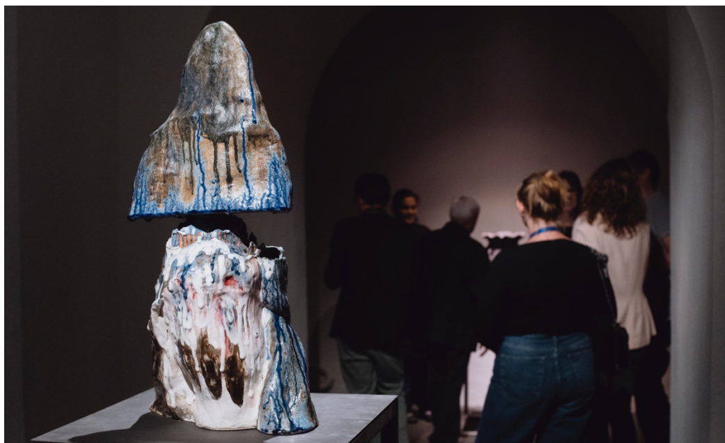
"Nostalgie V" (2020) by Myung-joo Kim (2019 New Member) at the opening of the Ariana Museum exhibition "MIGRATION(S)" on Day 1 of the 2022 Geneva Congress.