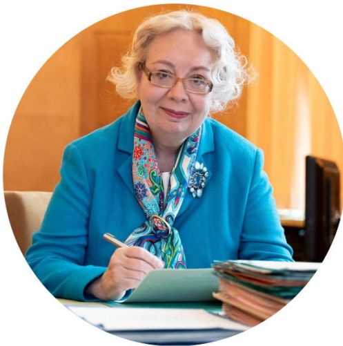
Tatiana Valovaya Director-General, UN Geneva

In line with the IAC's Statutes regarding the nomination of Members of Honour by the host country organisation, with this letter we, the IAC Geneva Steering Committee of the 50th Congress together with those who collaborated at the forefront for its success, would like to welcome Mrs. Tatiana Valovaya to become a Member of Honour of the IAC.